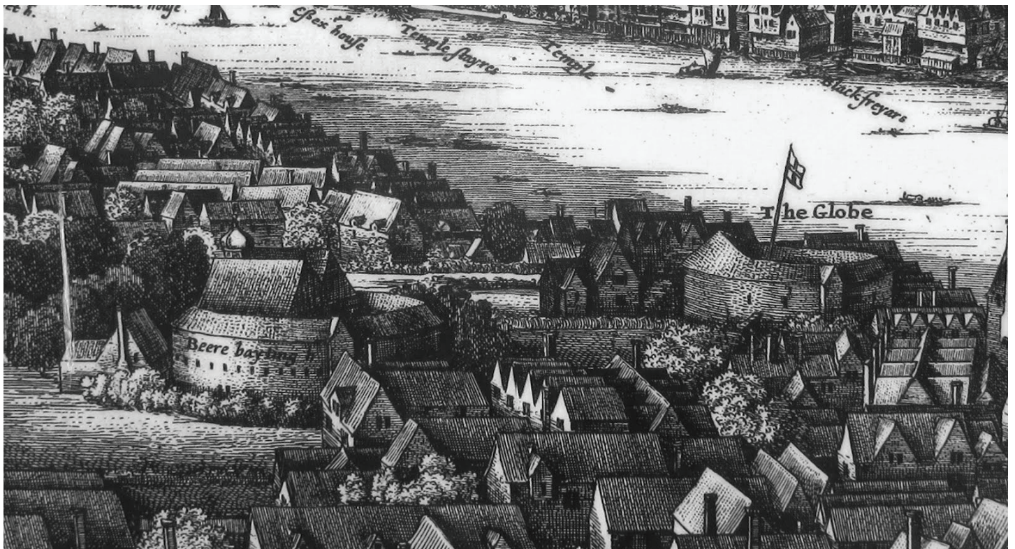
This engraving of Bankside, made in 1644, shows the tiled roof and large tiring house and stage roof (like an upside-down W) of the second Globe. In this picture the labels were swapped around. The Globe is actually on the left and the baiting arena on the right.

Streete and his workmen built a brick base for the theatre. The walls were made from big timber frames, filled with smaller slats of wood covered with plaster that had cow hair in it. Because the owners were struggling for money, they used the cheapest options in the building process. For example, the roof of the theatre was thatched with reeds, not covered with more expensive tile. In 1599 the theatre opened and was a huge success.