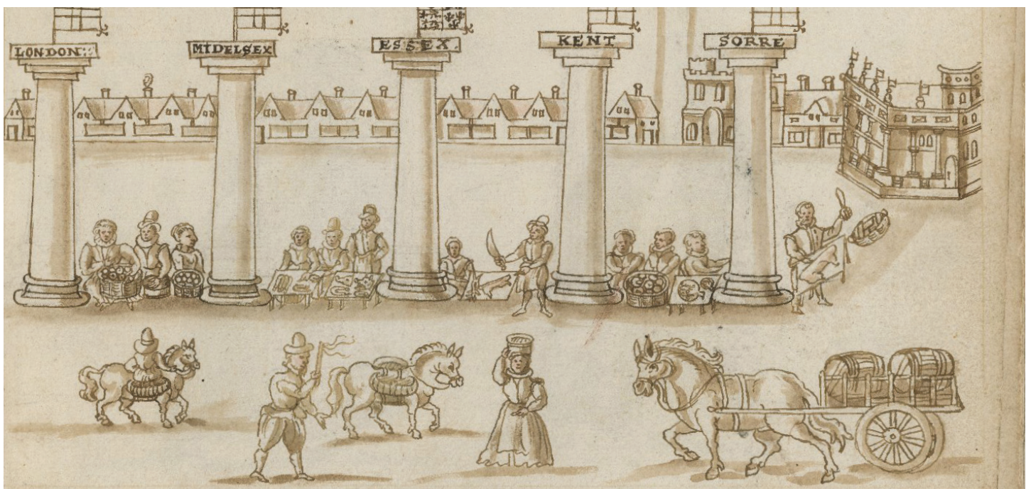
A market in London in 1598, with the names of the county sellers shown above their stalls.

Silver Street: From about 1602, Shakespeare rented lodgings in the Silver Street house of the Mountjoys, a family of French immigrants who made expensive hats.